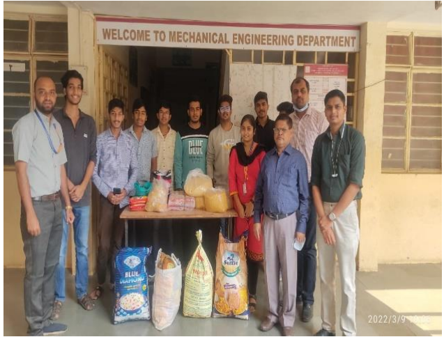
Donation Drive by Magazine Committee