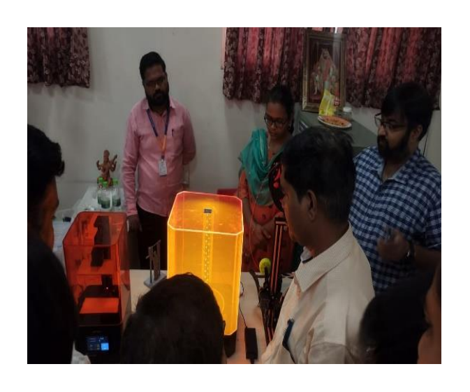
Workshop on 3D Printing, Staff.