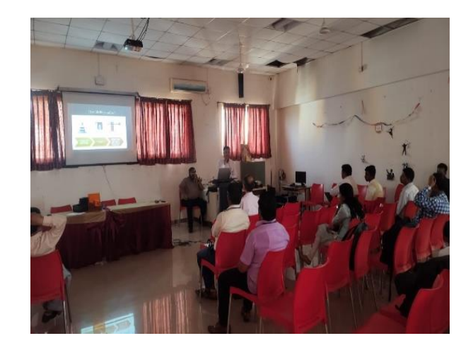
Workshop on 3D Printing, Staff