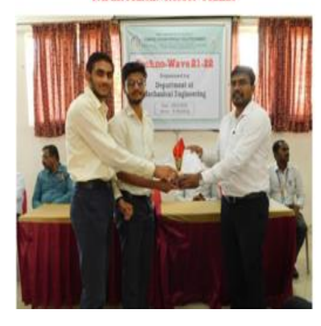
1<sup>st</sup> Prize: PAPER PRESENTATION- Student of GPP