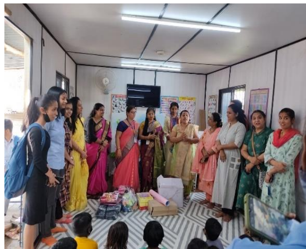
Donated livelihood needful items to Masti ki Pathshala at Maske Vasti, Ravet