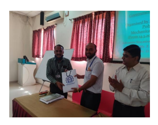
Workshop on AVTS, TYME