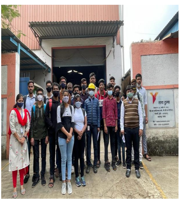
Visit to Tara Tools, Bhosari, Pune. TYME