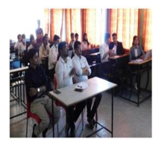
Judge Observing the Skills of Students while Presenting the paper