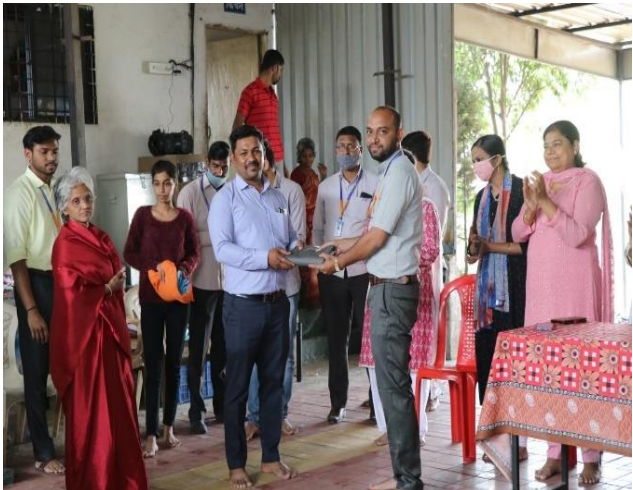
Donated livelihood needful items to orphanage