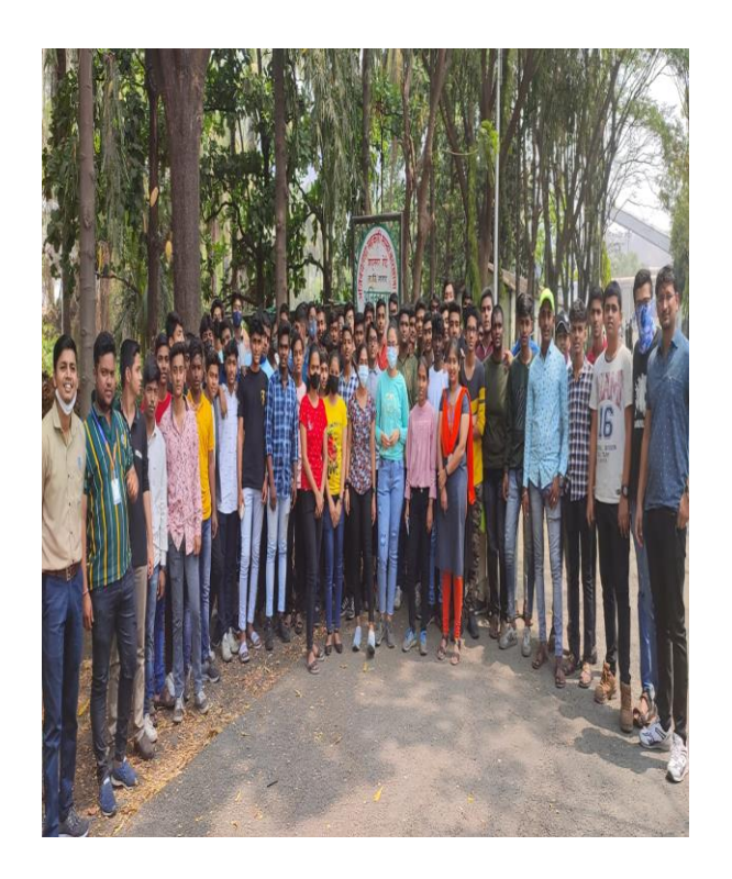
Visit to Ajinkyatara Sugar Factory, FYME